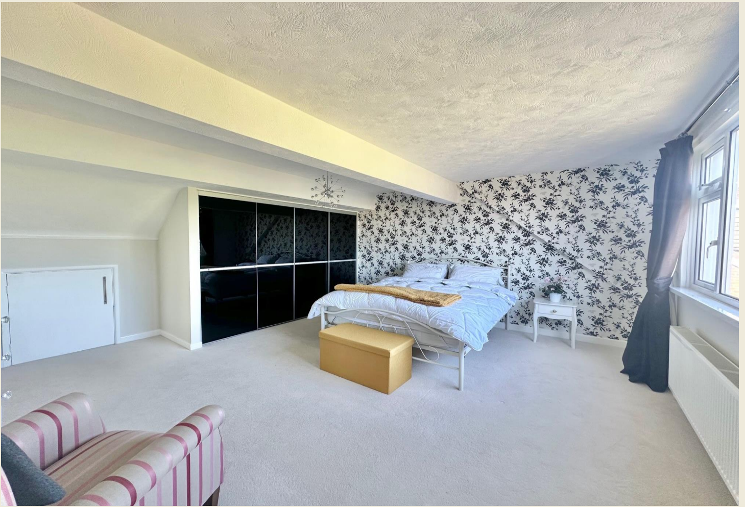
BEDROOM ONE 16'6 x 15'9