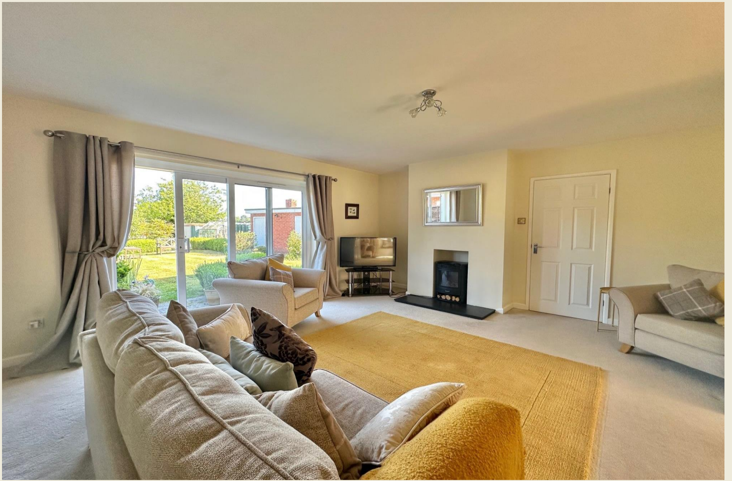
LIVING ROOM 15'11 x 13'4