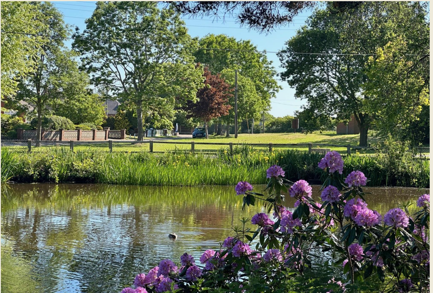
VILLAGE GREEN & DUCK POND