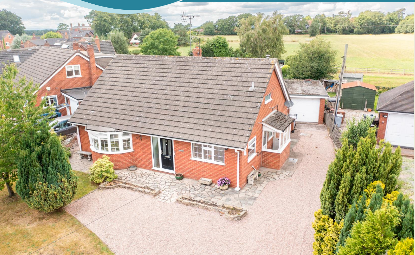
'HIGHFIELD' | 5 OLD SCHOOL LANE | HANKELOW NEAR AUDLEM | CHESHIRE | CW3 0JN | GUIDE PRICE £565,000