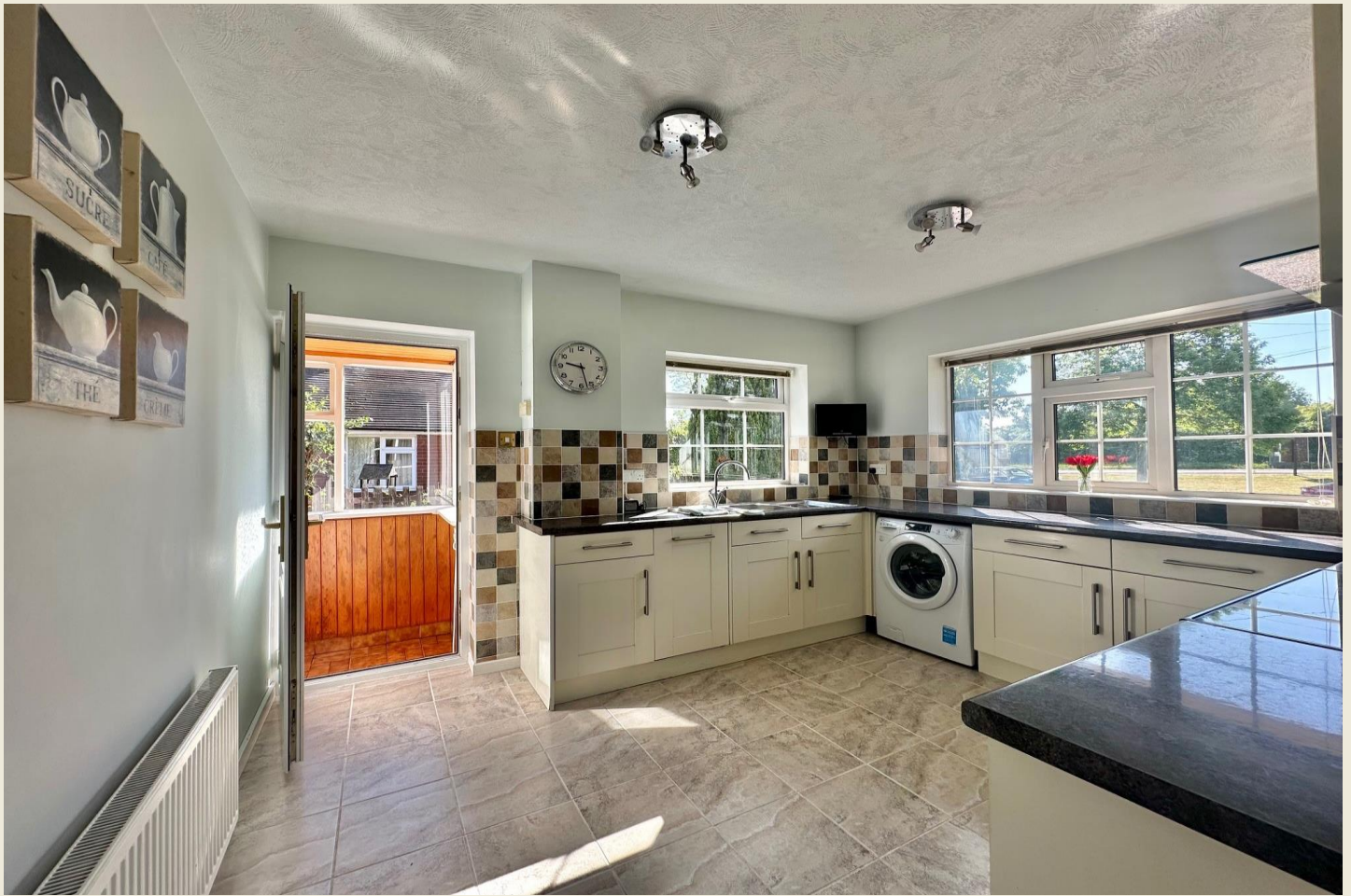
KITCHEN BREAKFAST ROOM 12'3 x 10'4