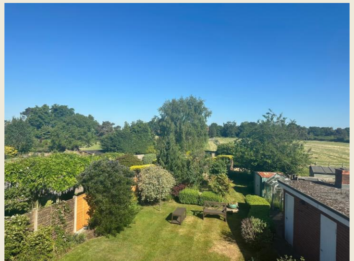
VIEW TO REAR FROM LANDING