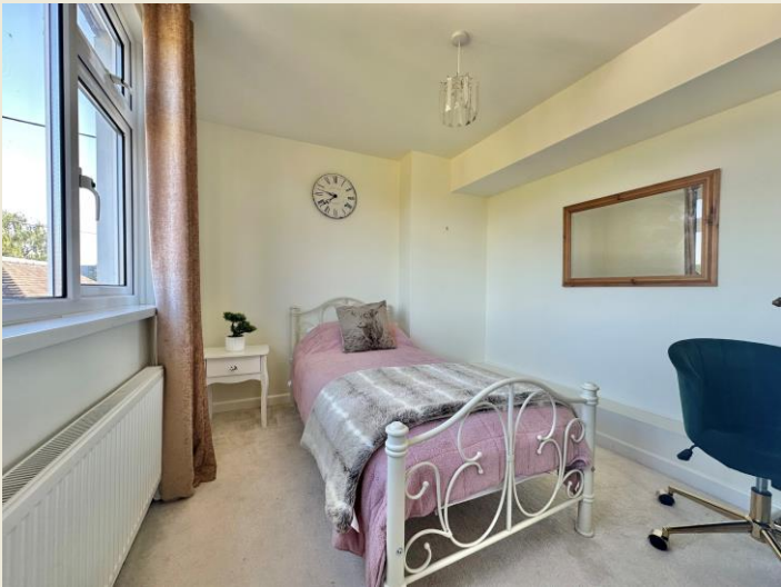
BEDROOM TWO 9'9 x 8'11

The property stands in a leafy position set back from the village green. Approached over a small single width lane there is a generous lawned front garden with graveled driveway providing ample off road parking for several vehicles which also leads to the detached single garage. Outside WC & additional garden store. The exceptional rear garden being predominantly laid to lawn offers a wonderful space in which to fully enjoy the glorious village setting with the adjoining open fields to the rear. Various fruit trees (including Victoria Plum), pretty planting & a small raised pond provide colourful features too. Oil storage tank. The exterior is simply sublime & enables the perfect enjoyment of the idyllic location the delightful property is nestled in.