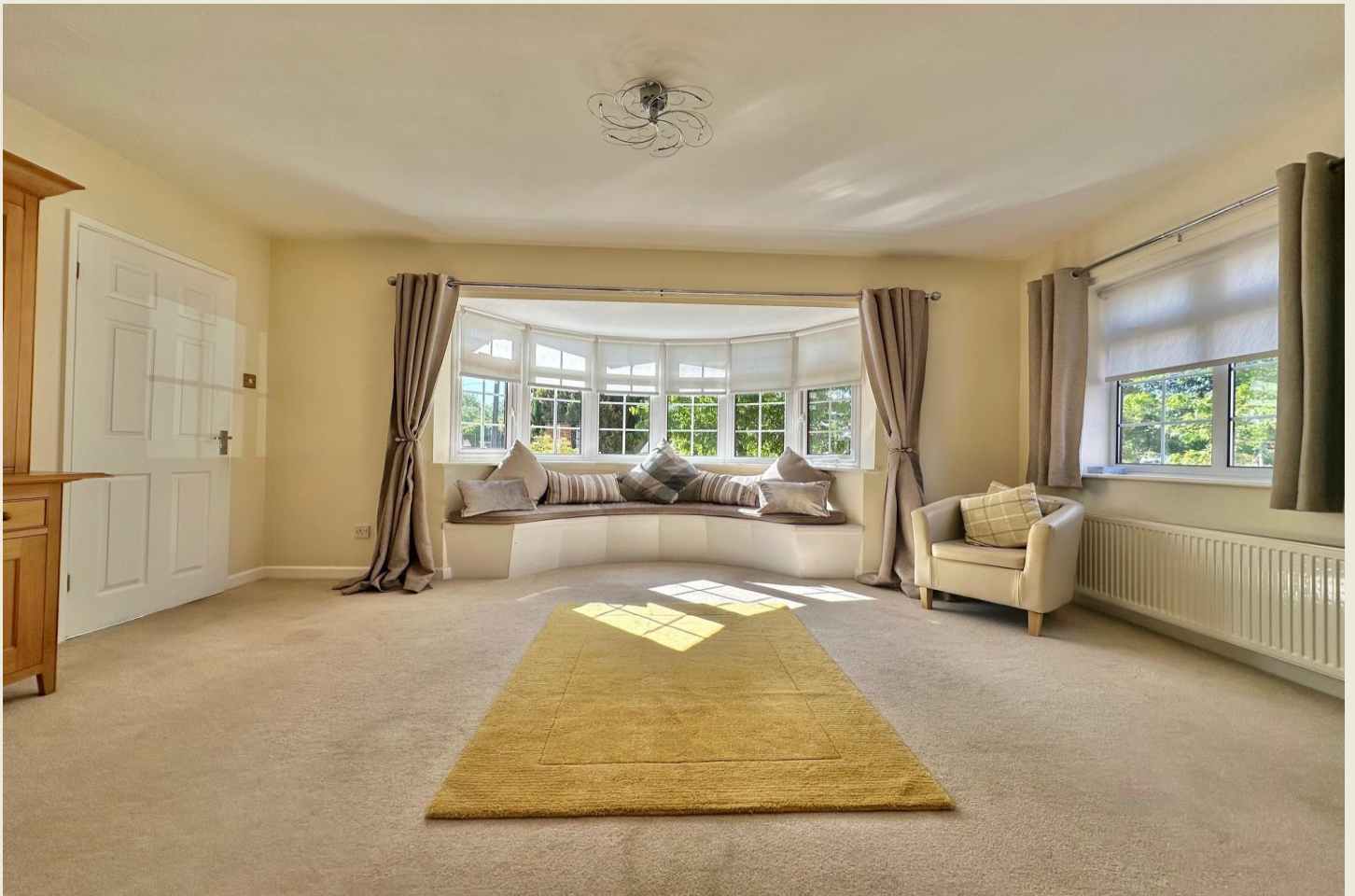
FORMAL DINING / SITTING ROOM 15'11 x 15'10